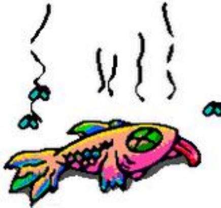
Talk to our neighbors