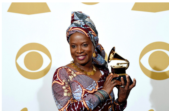
Join us for an evening with three-time Grammy Award-winning singer, activist and humanitarian, Angélique Kidjo .

Please help us celebrate literacy at our first annual Beyond Words fundraising event on Thursday, April 19 with remarks and music by Angélique Kidjo . A creative force with 13 albums to her name, Angélique was named “Africa’s premier diva” by Time . One of The Guardian’s 100 most inspiring women in the world, she was the first woman on Forbes’s list of the Most Powerful Celebrities in Africa.