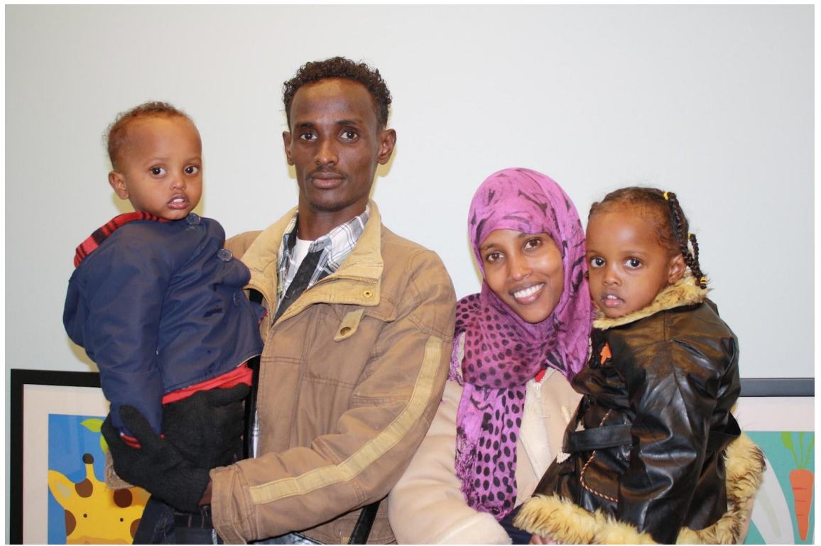
Who is this Family?